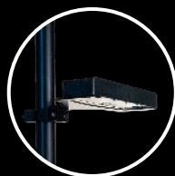
The Light Unit (not included) [5615363]