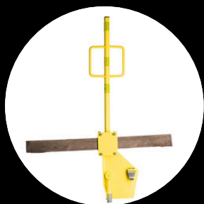
The Livhanken for Y-Beams [5611006] (High Handle integrated)