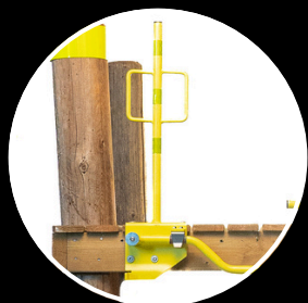
The Livhanken Top Mounted [5611005] (High Handle integrated)